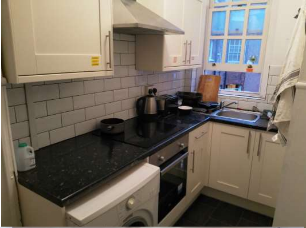
Room 1: 4.84m x 2.4m