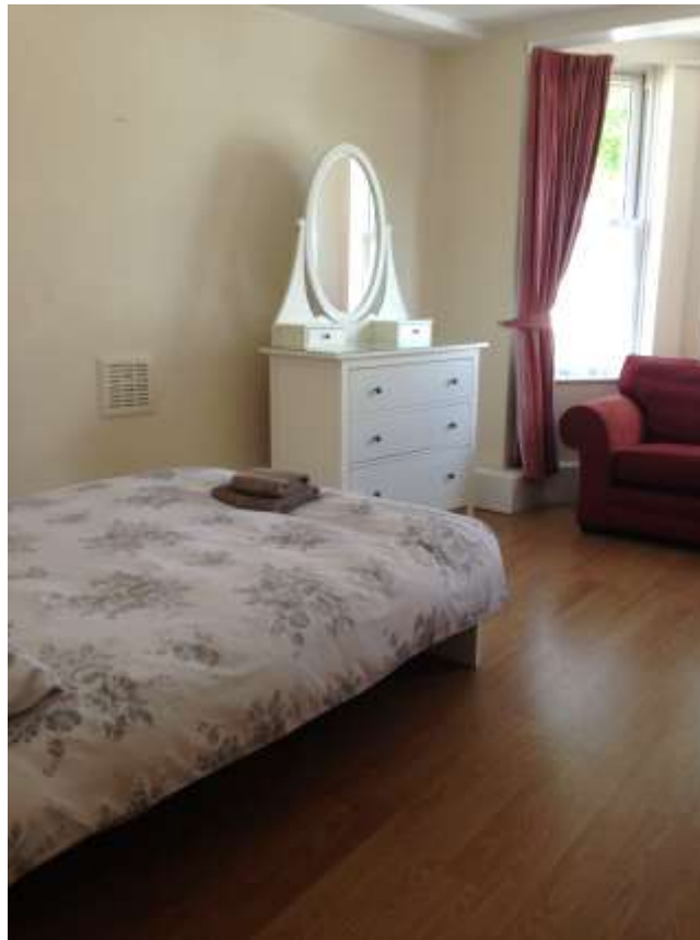
Room 3: 4.04m x 2.40m