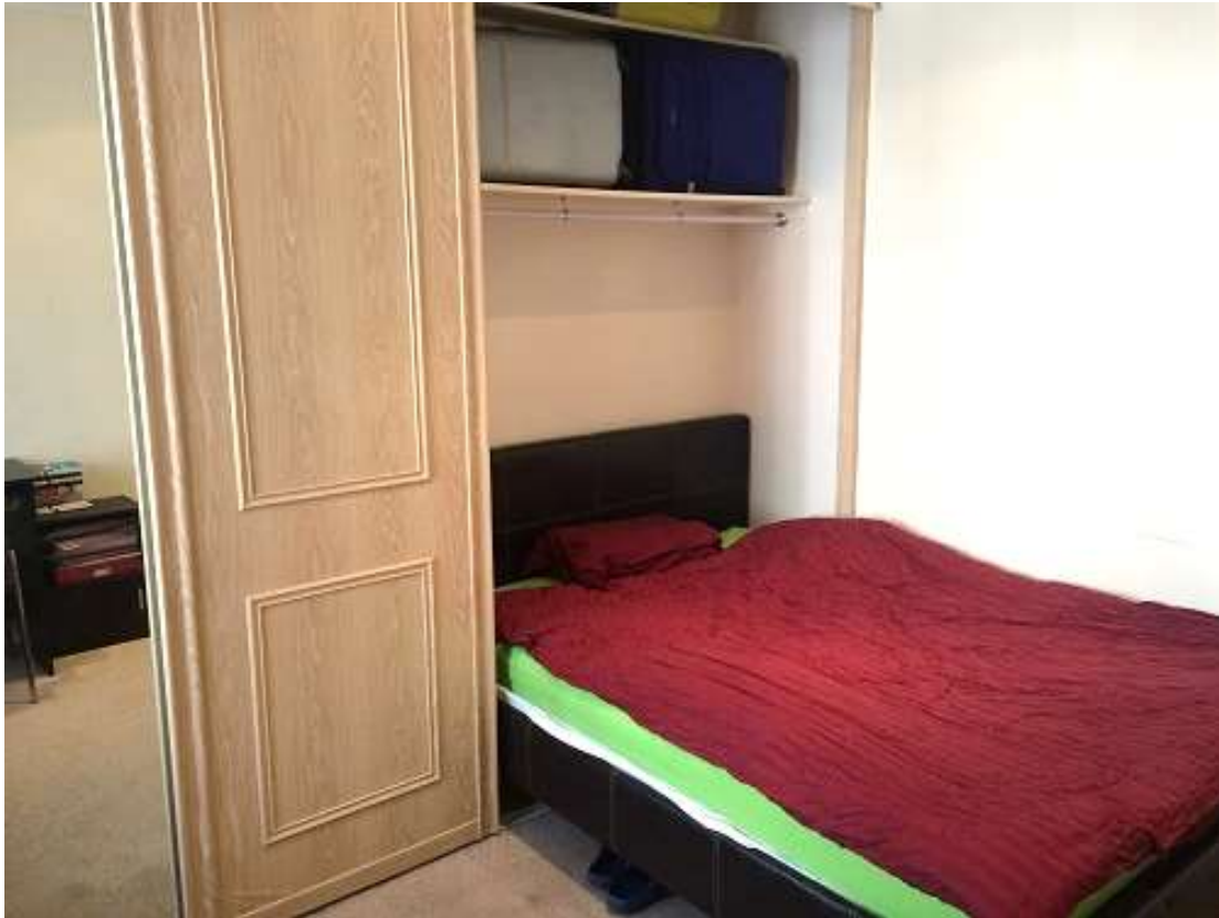
Room 4: 2.62m x 2.26m