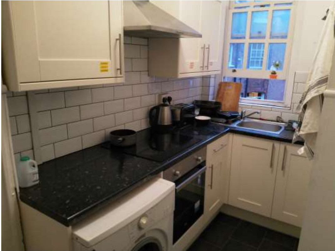
Room 1: 4.84m x 2.4m