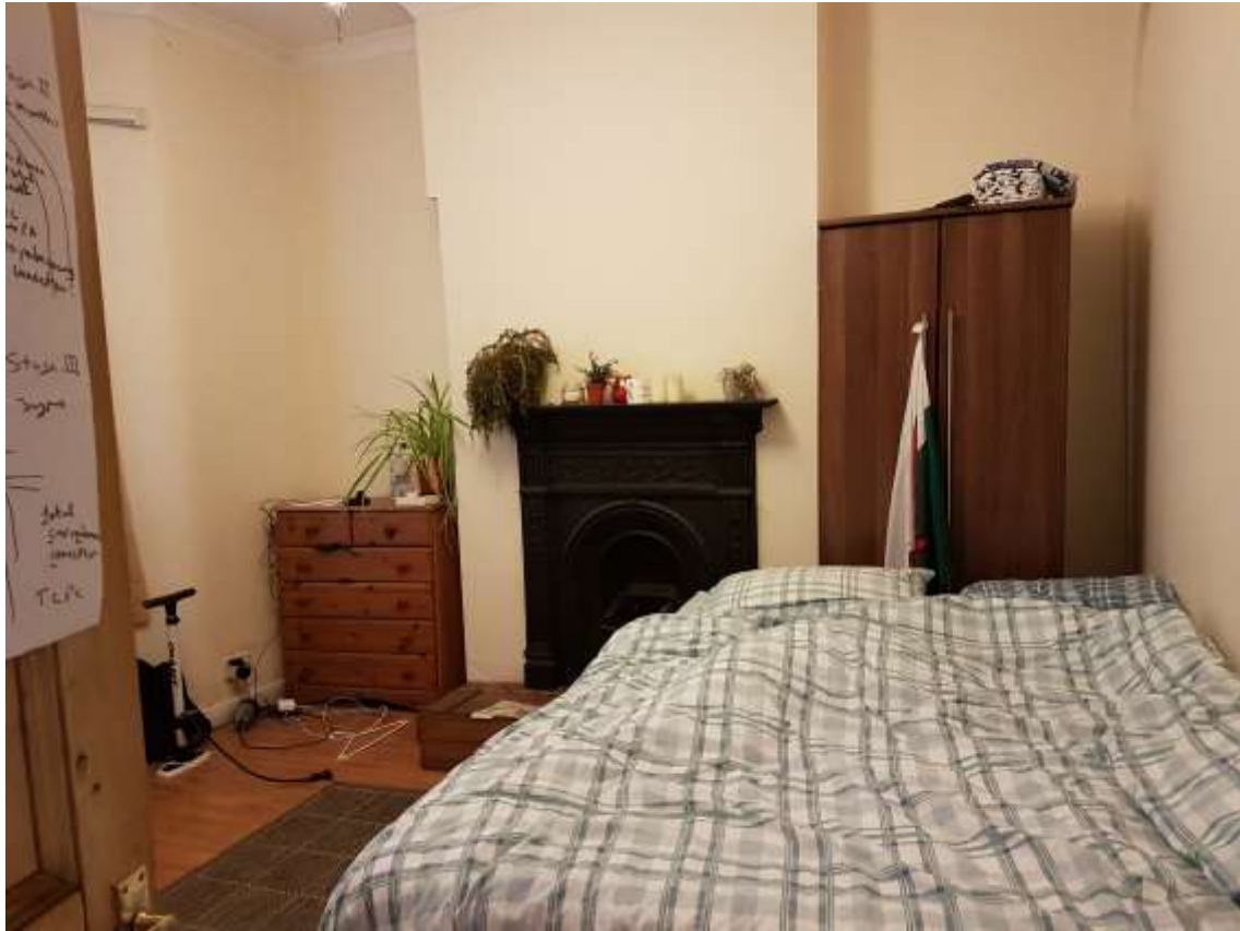
Room 2 11m 2